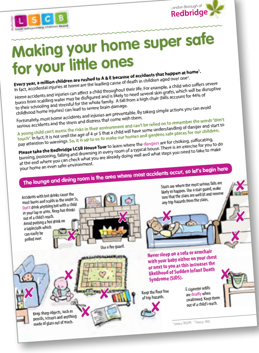
Redbridge CDOP leaflet for parents

To find out more about Child Safety Week and to sign up for free resources from the Child Accident Prevention Trust (CAPT), please visit www.capt.org.uk