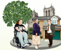
In the community