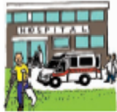
In a hospital